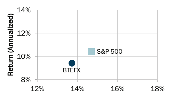
Risk (Annualized Standard Deviation)

The above chart illustrates the risk/return trade-off of the Fund relative to the index since the Fund's inception. In the illustration, risk is measured as the annualized standard deviation of monthly returns over the time period. The standard deviation is used as a measure of investment risk, and measures the degree of variation of returns around the average return. The higher the volatility of the returns, the higher the standard deviation.